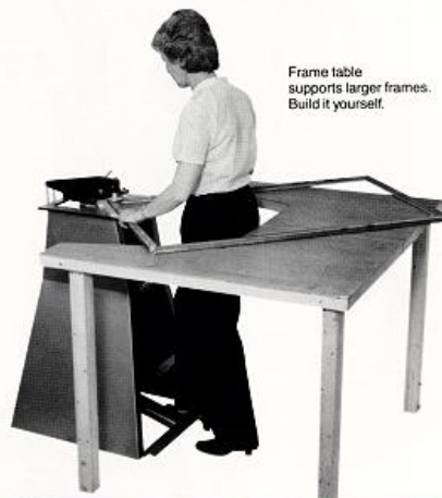
Frame table supports larger frames. Build it yourself.

Subject to specification and engineering changes without notice.