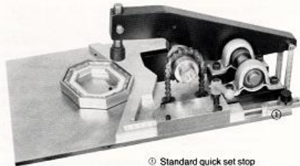
① Standard quick set stop for rapid frame assembly.

Optional fences interchange readily, with standard. Available for octagon & hexagon frames.